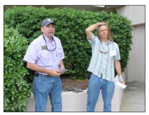
Announcing the Winners